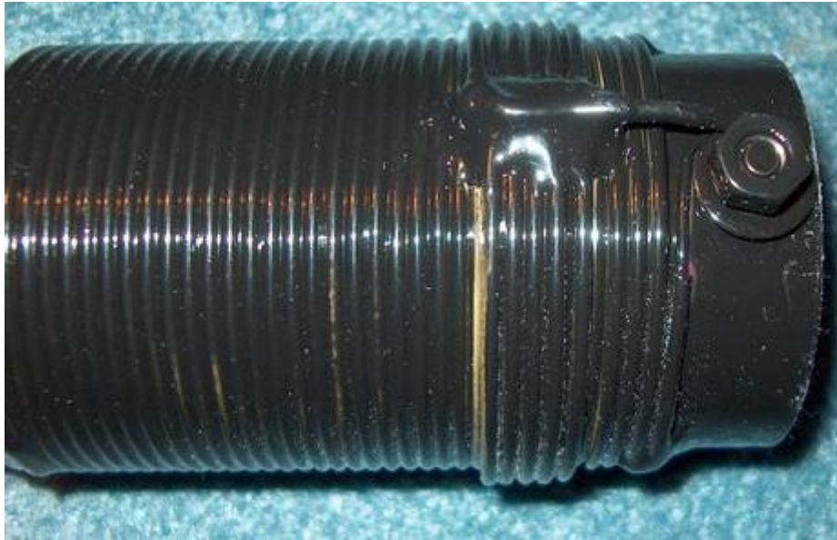
The 75-Meter coil

If you just wind the wire on the coil forms directly, this will result in the coil "springing back" and becoming loose on the form when you release the wire after winding it. I wound several extra turns on each coil as I wound it on the form, then removed the coil from the coil form and then squeezed it down around a slightly smaller form (actually a spray can of insect repellent.) I then removed the now slightly smaller diameter coil and gently screwed it onto the coil form, where it remained tight enough to stay in place properly.