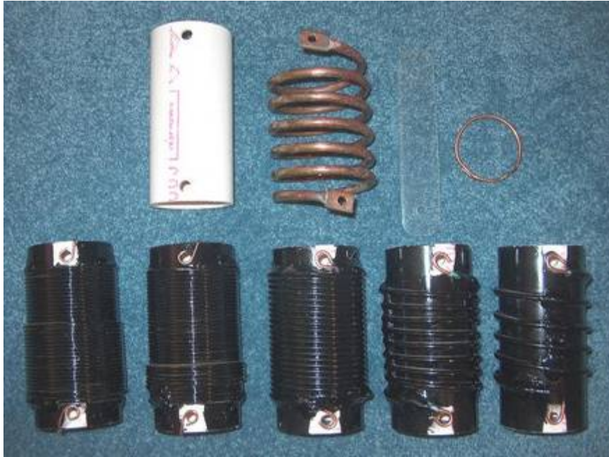
The complete Coil Set for the antenna.