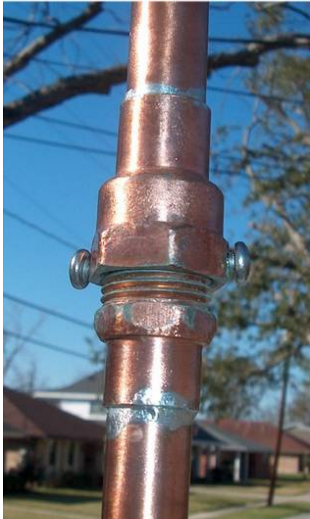
A (very) close up photo of those extra pipe fittings.

Hey! What's that extra set of pipe fittings doing, and why are they there? (Keep reading for the answer!)