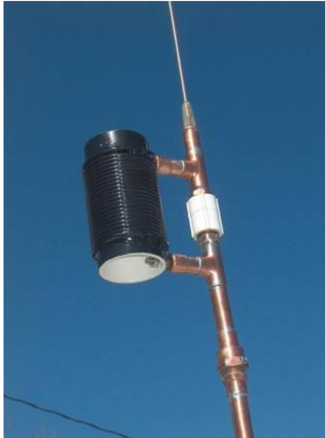
The 40 Meter loading coil in place on the antenna.

In order to accomplish this alignment without resorting to the use of shim stock, various thicknesses of washers, and all sorts of other chicanery, I decided I had to have a way to be able to rotate the coil around the mast in some way. Since everything was soldered together, I came up with the idea of using a pair of threaded mating fittings that I could simply twist to get the alignment exactly correct. I drilled and threaded a pair of holes through the outside (female) fitting so I could use a pair of stainless steel screws to lock the fittings in place after the adjustment was complete.