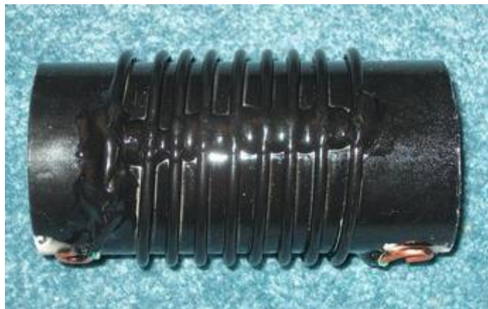
General Coil Construction

The 160 and 75-meter coils are wound using #14 AWG Nylon insulated wire; all the rest of the coils are wound with #10 AWG THHN insulated wire. Note that no terminals are used on the coils - the wire ends are simply wrapped around the mounting bolts. When the coil is attached to the antenna, the wire loops are pressed against the copper coil mounts to make the electrical connection by the coil form when you tighten the 1/4" nuts from the inside of the coil form.