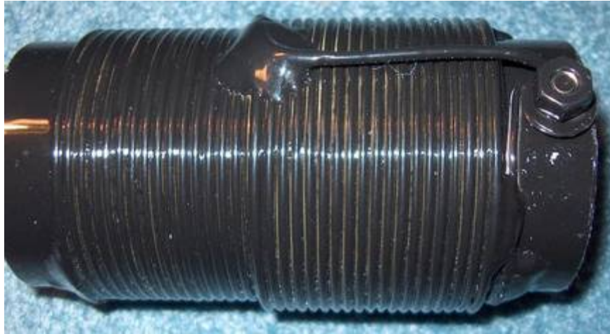
The 160-Meter Coil

Wound in the same manner as the 75-meter coil, the 160-meter coil required only 60% of the number of turns as would be needed if the windings were in a single layer. The trade off is that there are several stray resonances of the antenna system using this coil, but none of them cause any problems with normal operation. Since less wire is used in this coil than would be used in a single layer coil, the copper losses are less, but the dielectric losses are slightly higher due to the overlapped windings. However, the use of the "Z" winding method minimizes the dielectric losses as much as possible. The measured R_{ac} loss of this coil is less than the originally calculated coil using #22 AWG wire.