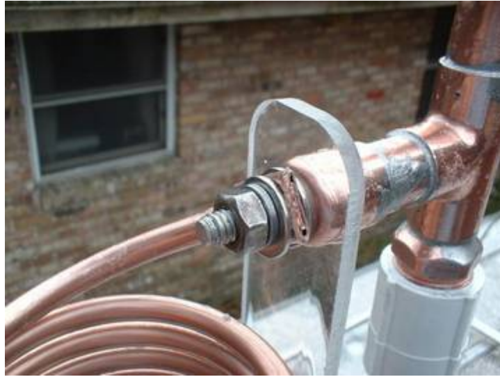
This is a close-up picture of one of the ends of the loading coil.

You can see the coil tube inside the larger flattened copper tube. The larger tube added structural strength to the ends of the coil and provided a larger area for drilling the mounting bolt holes through the coil ends.