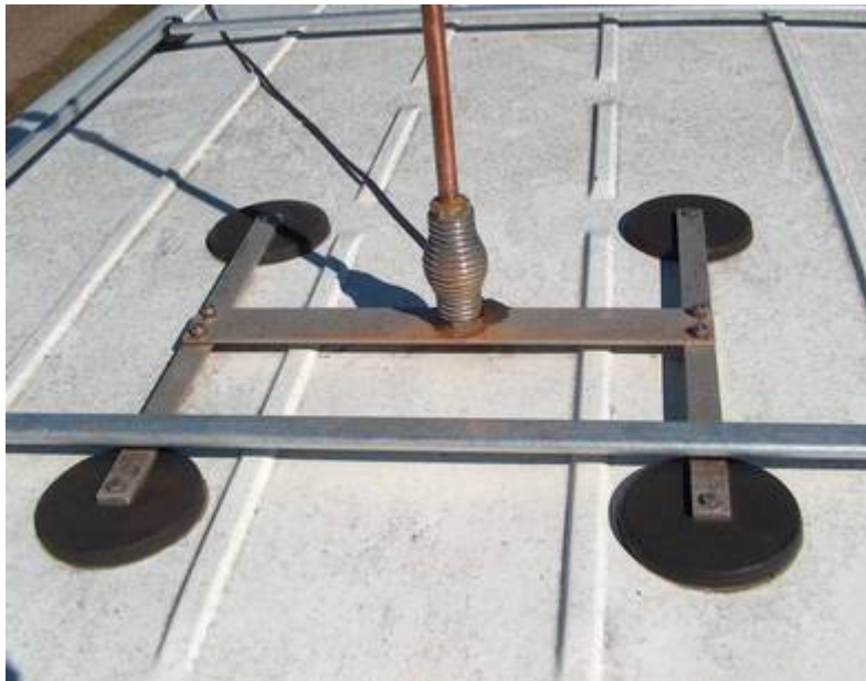
A big antenna needs a serious mag-mount!

You can see the coil tube inside the larger flattened copper tube. The larger tube added structural strength to the ends of the coil and provided a larger area for drilling the mounting bolt holes through the coil ends.